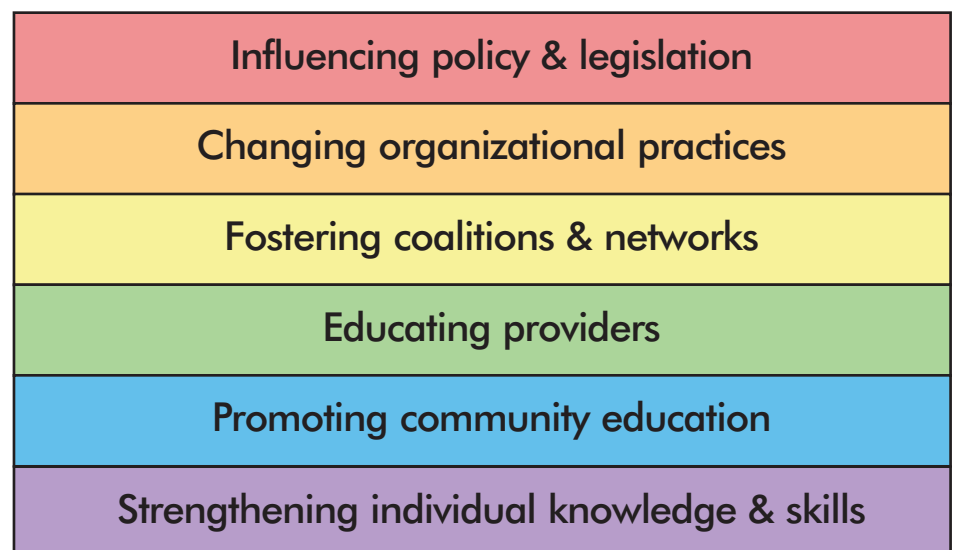
FIGURE 2. THE SPECTRUM OF PREVENTION

The Spectrum of Prevention (see Figure 2) offers a framework for developing effective and sustainable primary prevention initiatives that have the potential to affect community and systems-level changes. The inter-relatedness, or synergy, among levels of the Spectrum maximizes the results of each activity and creates a more transformative force. As Sara Kershner, from Generation FIVE said, “Sustainable models for community education focus on public education tied to collective action. It is not about one project; it is about a community-wide response.” While all levels of the Spectrum are essential for sustaining change, community and systems-level change require efforts at the broadest levels of the Spectrum . These include changing organizational practices and influencing policy and legislation.